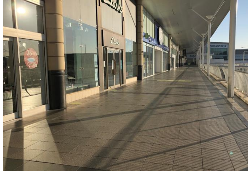
WHAT GREAT LOOKS LIKE