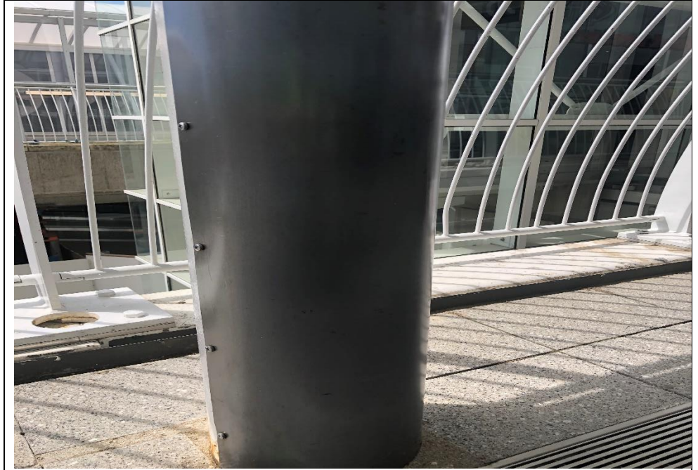
WHAT GREAT LOOKS LIKE