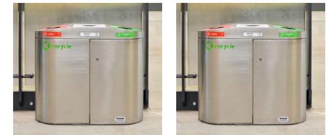
*Branding and customisation options available