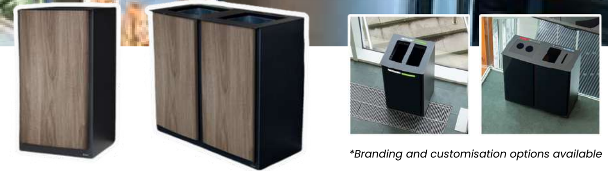
*Branding and customisation options available